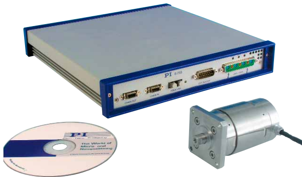
E-755 digital NEXLINE® controller with N-214 nanopositioner, 20 mm travel range.