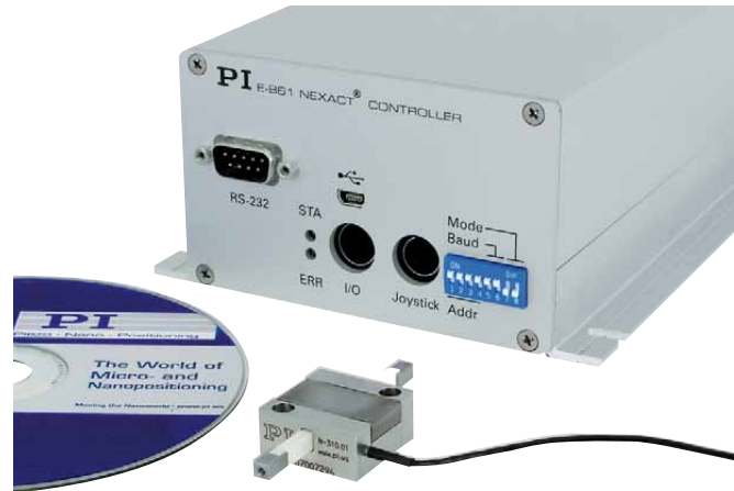
PiezoWalk® System: E-861.1A1 NEXACT® Controller with open-loop N-310.01 NEXACT® linear drive; suitable for installation in stage with linear encoder